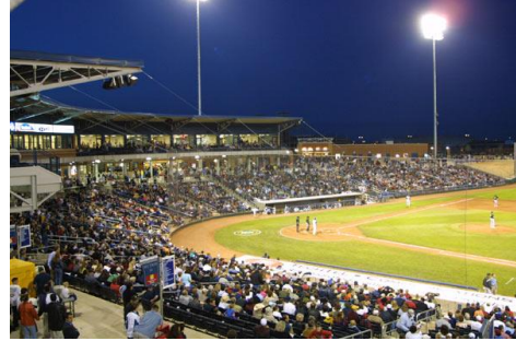
Figure 3. Rock hounds Stadium in Midland

Midland College was formed in 1972 as a 2-year community college to serve the regional population. With an enrollment population of 6,000 students, the college's service area of 12,008 square miles encompasses 5 counties and is larger than the state of Rhode Island. Beyond the West Texas region, Midland College offers many of its science courses on-line and via video-conferencing which make its courses available world-wide. Part of its mission is to offer the premier opportunity in STEM education for freshman/sophomore curricula that can be had. Toward that end, Midland College has invested in science facilities and faculty that promote ongoing undergraduate research in Geology, Engineering, Chemistry, Biology, and Marine Science. Articulation agreements are in place for the transfer of academic credits to universities in the University of Texas System, the Texas A&M system, the Texas Tech University system, and the Texas State University system as well as private colleges and universities. The college reflects the diverse population that it serves and is proud to be designated a Hispanic Serving Institution (HSI).