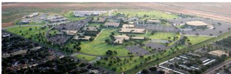
Figure 1: Aerial View of the Midland College Campus

Midland College was formed in 1972 as a 2-year community college to serve the regional population. With an enrollment population of 6,000 students, the college's service area of 12,008 square miles encompasses 5 counties and is larger than the state of Rhode Island. Beyond the West Texas region, Midland College offers many of its science courses on-line and via video-conferencing which make its courses available world-wide. Part of its mission is to offer the premier opportunity in STEM education for freshman/sophomore curricula that can be had. Toward that end, Midland College has invested in science facilities and faculty that promote ongoing undergraduate research in Geology, Engineering, Chemistry, Biology, and Marine Science. Articulation agreements are in place for the transfer of academic credits to universities in the University of Texas System, the Texas A&M system, the Texas Tech University system, and the Texas State University system as well as private colleges and universities. The college reflects the diverse population that it serves and is proud to be designated a Hispanic Serving Institution (HSI).